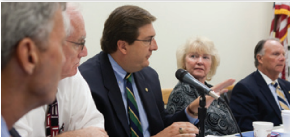
Since natural gas production ramped up in Pennsylvania, I have worked with my colleagues to enhance the state's efforts to use the industry to promote job creation and clean energy policies.

HARRISBURG OFFICE: 211 Ryan Office Building / PO Box 202099 / Harrisburg, PA 17120-2099 Phone: (717) 787-3531 Fax: (717) 705-1986