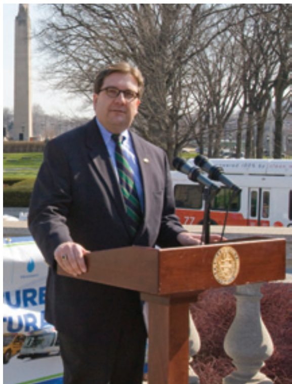
This spring, I unveiled my House Bill 1087 at the State Capitol as part of the Marcellus Works package, which promotes clean energy growth.

The legislation, which is supported by both Republican and Democrat colleagues, is currently awaiting the consideration of the House Finance Committee.